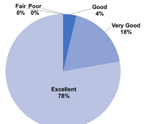
McMaster Muskoka Seminars 2014 - August 5, 2014 Supportive Psychotherapy: Ten Things to Do, and Ten Things to Avoid